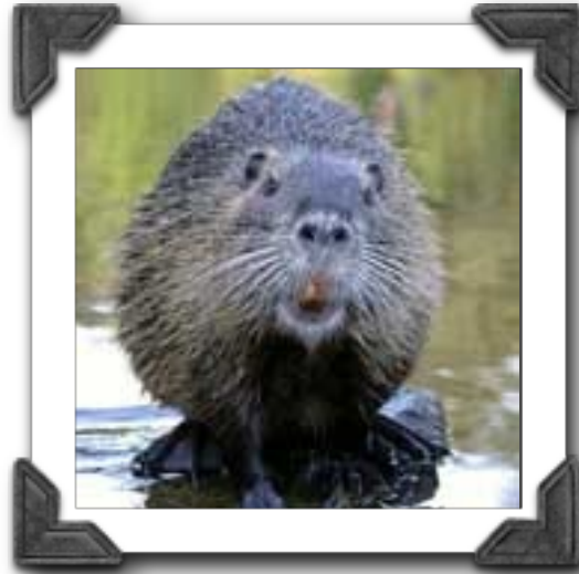
Coaches' Cooler - Havill Family

Thanks to our tent setup and coaches' cooler volunteers!!! As an "incentive" for volunteers for the coaches cooler and the tent setup, each week we will include a picture of the swimmers from the volunteering families in the buzz!